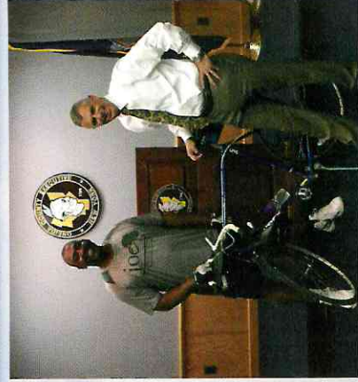
Printing Donated by PJ Green inc., Utica, NY